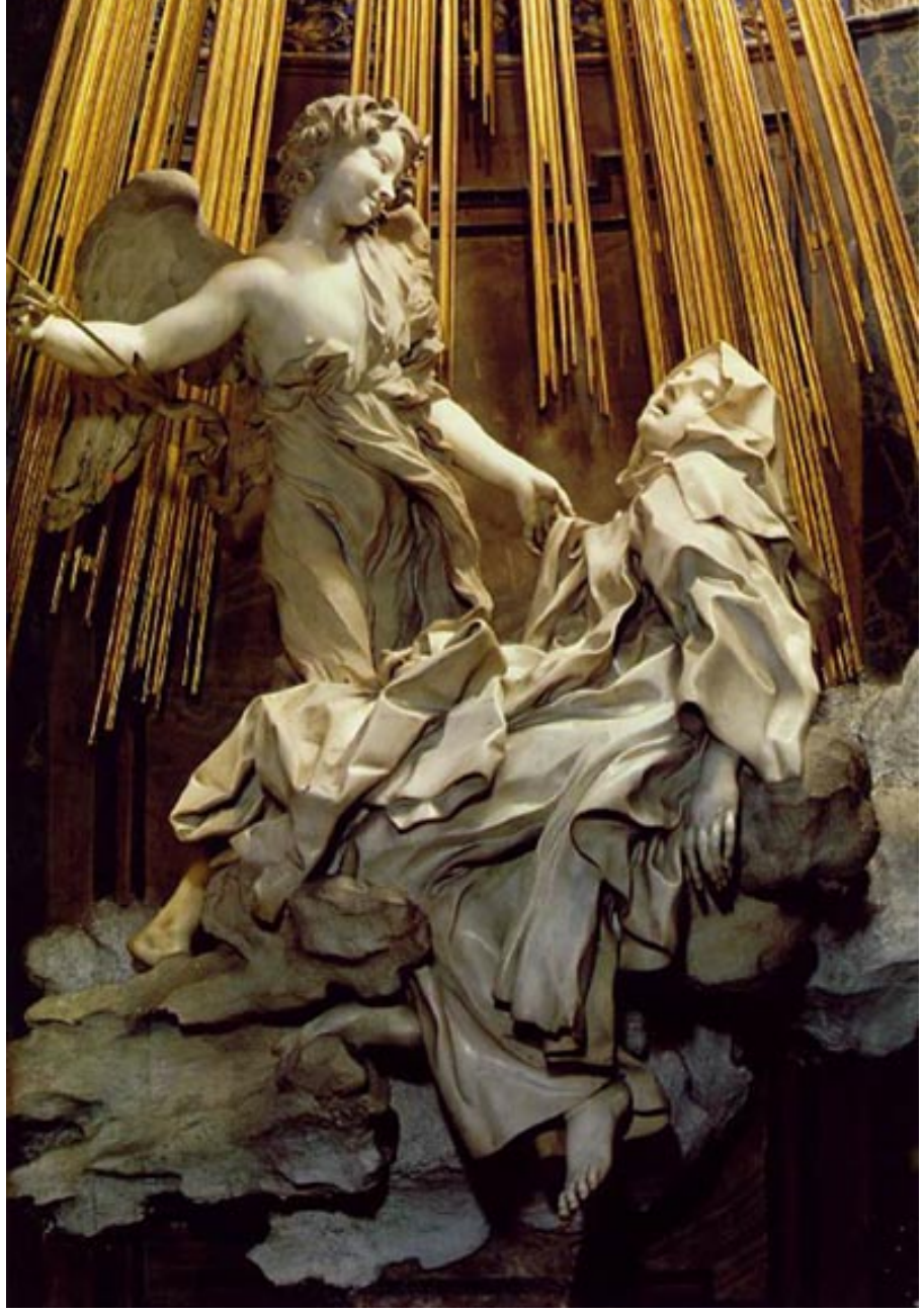
Figure 1 (Schama, 2006,115)

"While content and language form a certain unity in the original like a fruit and its skin, the language of the translation envelopes its content like a royal ample folds". Walter Benjamin (Bal,2003)