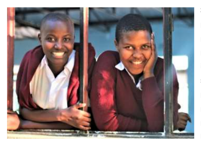
Two Orkilili pupils relax during a break in classes

SHOCC continued to support Orkilili during 2021 and provided funding to help the school during the Covid pandemic. With pupils unable to attend classes, the payment of school fees ceased and when conditions improved allowing pupils to return, face masks, sanitisers and other protective equipment had to be provided. The school continued to face challenges and pupil numbers have not recovered following the pandemic. Many pupils were forced to obtain work to help their families survive and several girls married or became pregnant and left school. A new future is