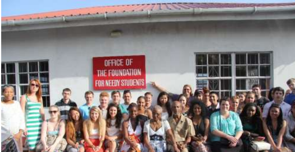
Undergraduates and Master Tourism students outside the Foundation for Needy Students building. In