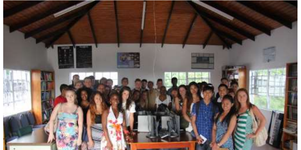
Inside the new library presenting the donations raised through a variety of initiatives at the university before the visit